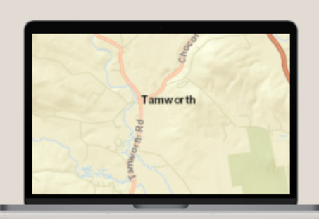
TOWN MAPS Click on the map for our online database